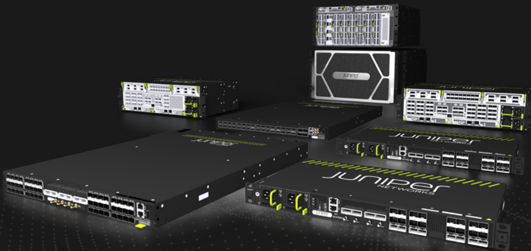
ACX7000 Series Family